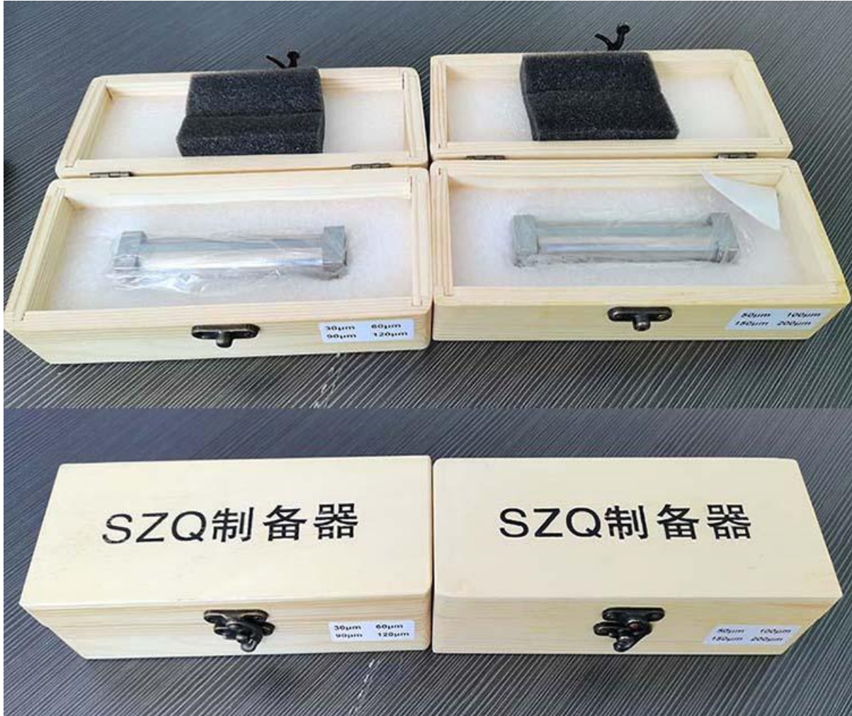
(Packing for your reference only)